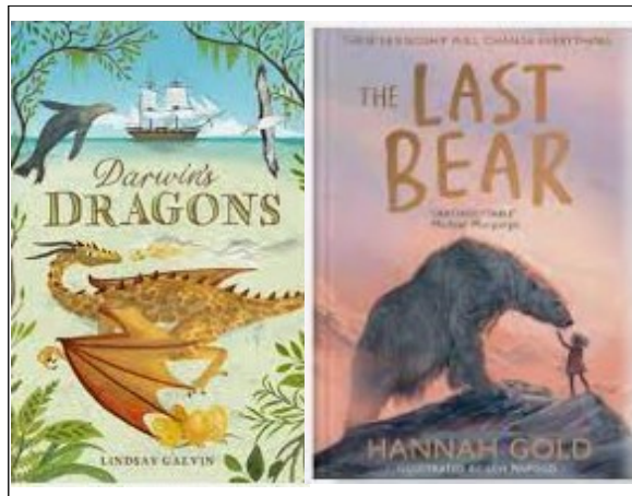
Darwin's Dragons and The Last Bear.