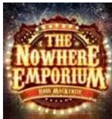
The Nowhere Emporium by Ross MacKenzie

In Literacy we are continuing to read 'The Nowhere Emporium', a book the children are really enjoying. The children have really got to know the characters and can't wait to find out what happens to them.