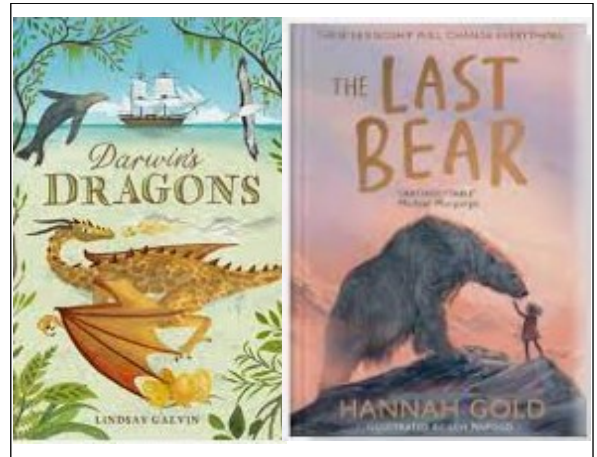
Darwin's Dragons and The Last Bear.